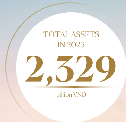
TOTAL ASSETS (billion VND)