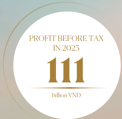
PROFIT BEFORE TAX (billion VND)