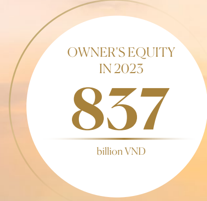
OWNER'S EQUITY (billion VND)