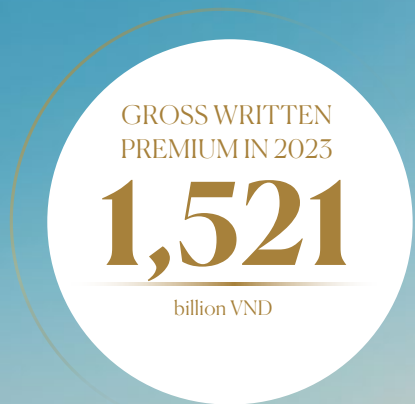
GROSS WRITTEN PREMIUM IN 2023 (billion VND)